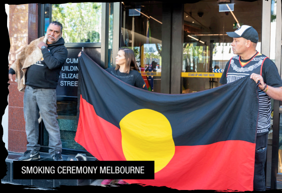
SMOKING CEREMONY MELBOURNE