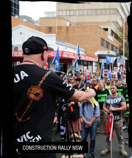
CONSTRUCTION RALLY NSW