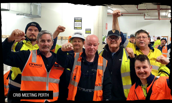
CRIB MEETING PERTH