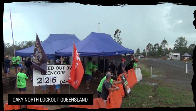
OAKY NORTH LOCKOUT QUEENSLAND

My father was a seaman, my mother was a shop steward in the match work factory, and my brother was one of the best union officials I've seen operate.