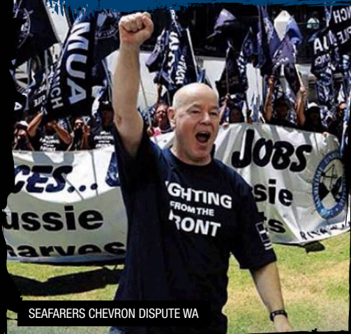
SEAFARERS CHEVRON DISPUTE WA