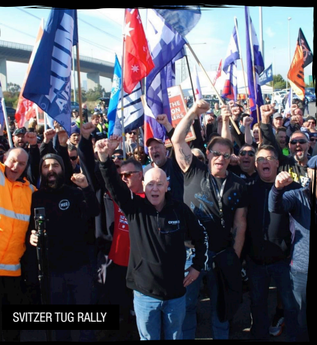
SVITZER TUG RALLY