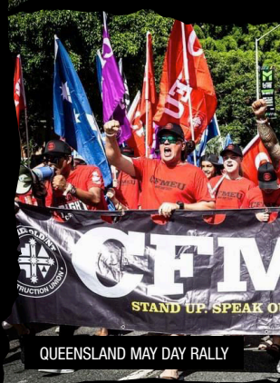
QUEENSLAND MAY DAY RALLY