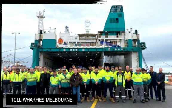
TOLL WHARFIES MELBOURNE