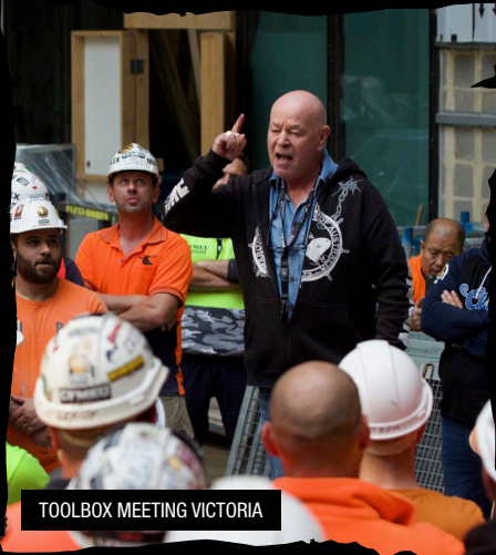
TOOLBOX MEETING VICTORIA