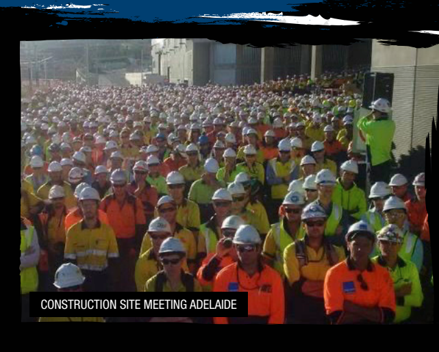
CONSTRUCTION SITE MEETING ADELAIDE