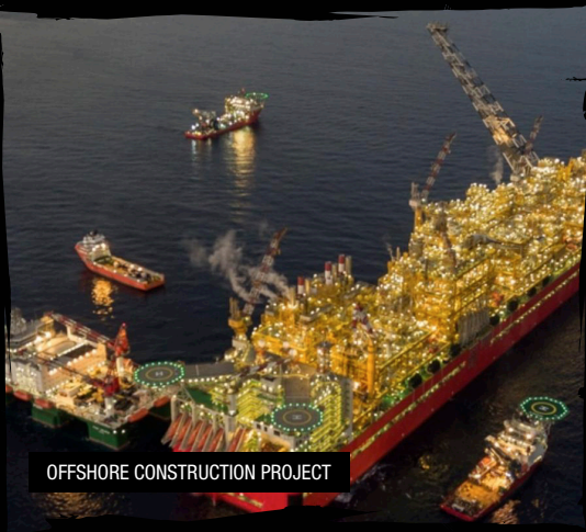
OFFSHORE CONSTRUCTION PROJECT