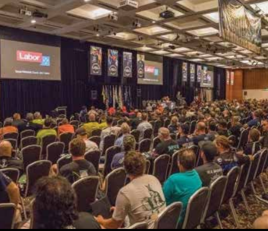
WA CONFERENCE MARITIME & CONSTRUCTION DIVISIONS