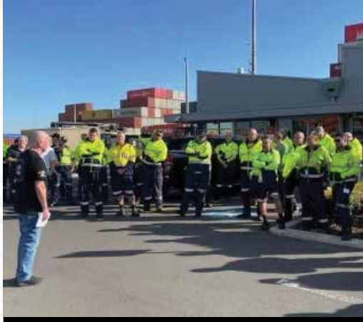
ADDRESSING MUA MEMBERS ON THE WHARF SYDNEY