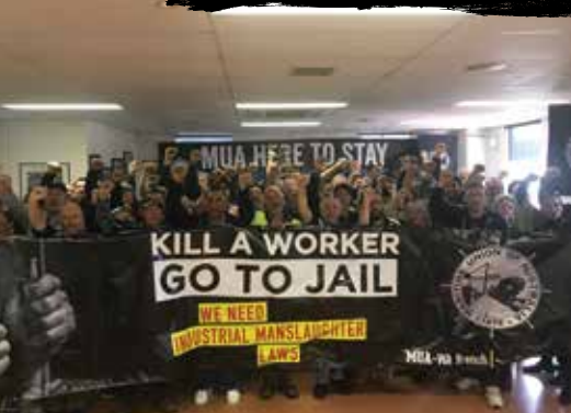
KILL A WORKER GO TO JAIL MUA WA RALLY