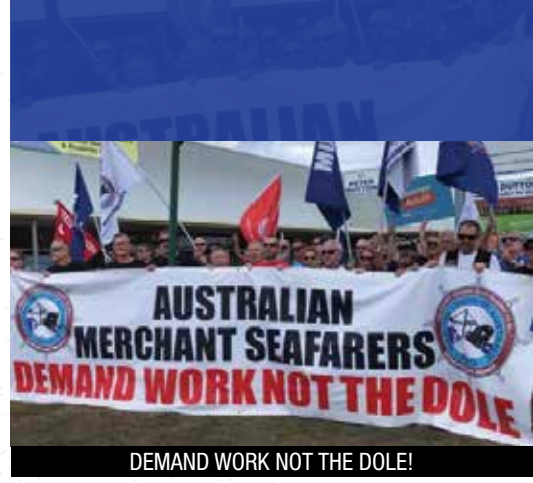
DEMAND WORK NOT THE DOLE!