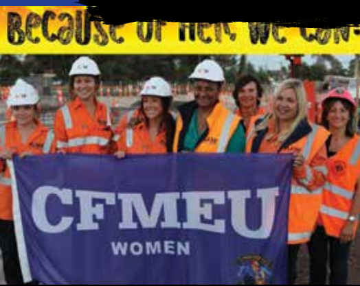
CFMMEU WOMEN IN CONSTRUCTION