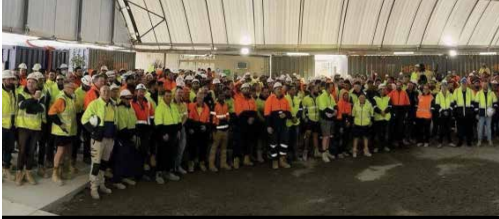
CONSTRUCTION DIVISION MEMBERS SYDNEY