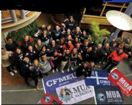
CFMMEU WOMENS CONFERENCE 2022