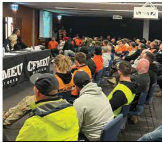
VIC BRANCH CONSTRUCTION DELEGATES MEETING