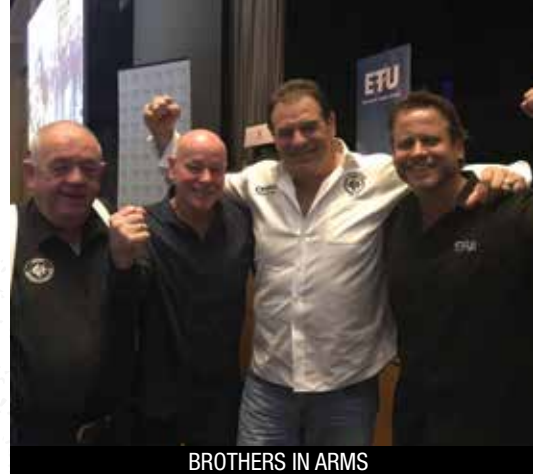
BROTHERS IN ARMS