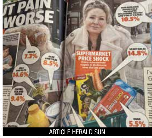
ARTICLE HERALD SUN

WHEN THE RICHEST 1% HAS MORE WEALTH THAN 70% OF AUSTRALIANS COMBINED... THAT'S INEQUALITY