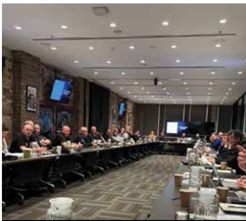
NATIONAL WHARF DELEGATES MEETING SYDNEY