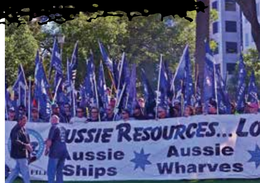
WA RALLY AUSSIE RESOURCES LOCAL JOBS