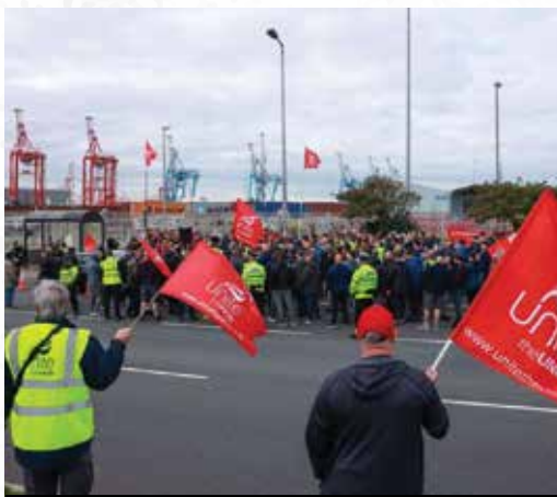
LIVERPOOL DOCKERS STRIKE