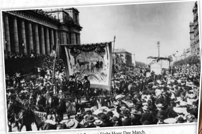
1900. Melbourne Eight Hour Day March.

1911 The Australian Builders Labourers Federation was created to represent building workers. The BLF quickly became instrumental in not only fighting for workers' wages and conditions but for their role in larger community campaigns. In 1972 it became the Australian Building Construction Employees' & Builders' Labourers' Federation until it was deregistered in 1974. Resuming in 1976, it lasted until 1986 when it was deregistered permanently. This varied state by state.