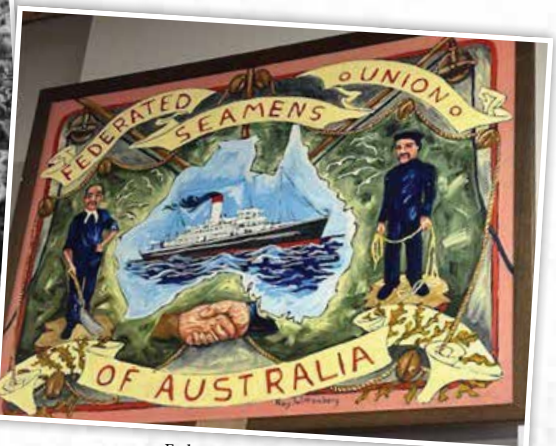
Federated Seamens Union