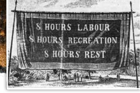
1856. 8 Hour Day Banner