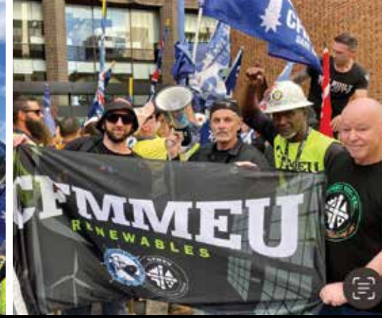
WA COST OF LIVING CRISIS RALLY