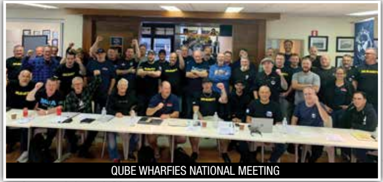
QUBE WHARFIES NATIONAL MEETING

“ IF YOU'RE NOT AT THE TABLE YOU'RE A PART OF THE MENU! ”