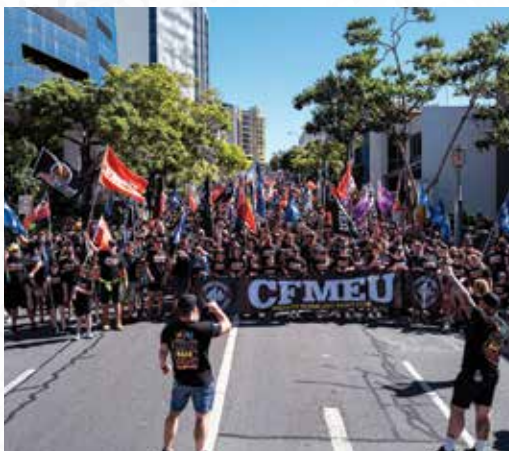
QLD MAY DAY