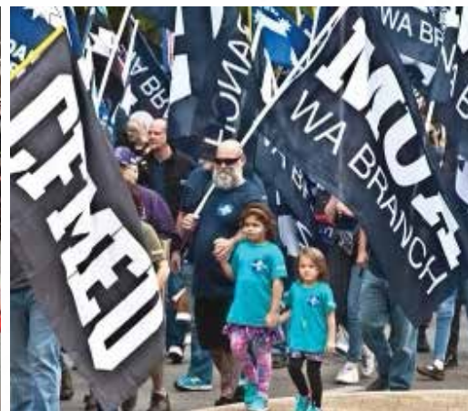
WA MAY DAY