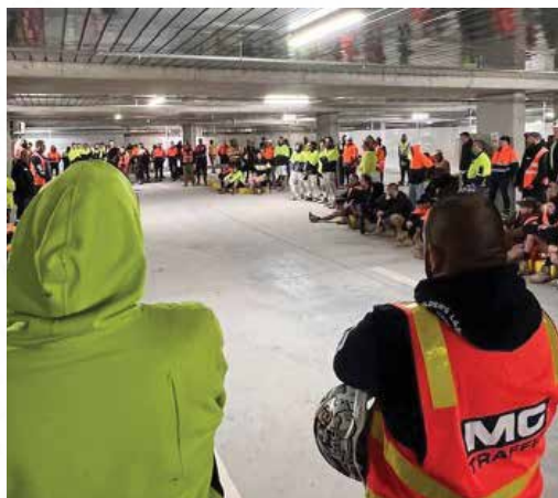
SITE MEETING MELBOURNE