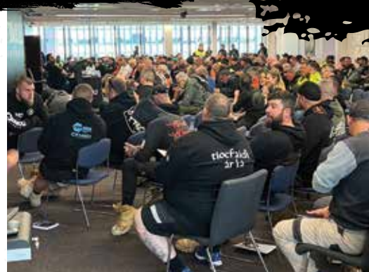
LEADING THE WAY: CFMMEU CONSTRUCTION DIVISION