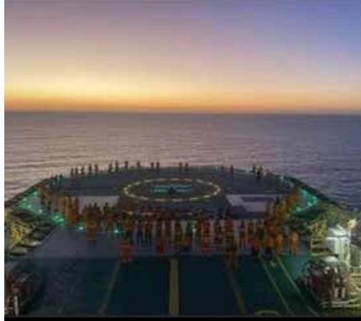
AUSSIE OFFSHORE WORKERS HONOURING ANZAC DAY