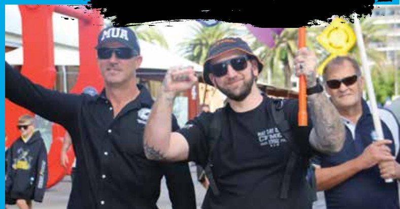
MAY DAY RALLY