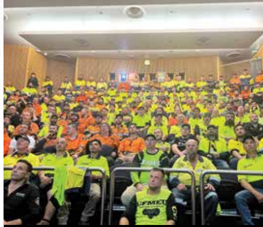
WA BRANCH DELEGATES EBA MEETING