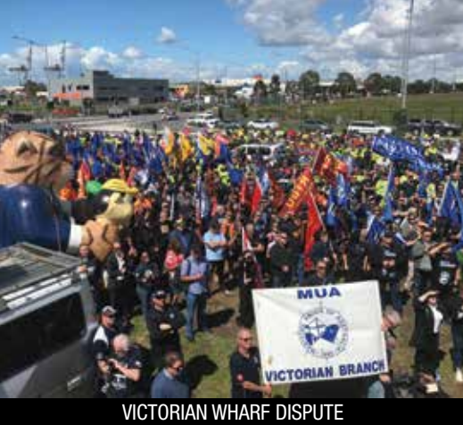
VICTORIAN WHARF DISPUTE