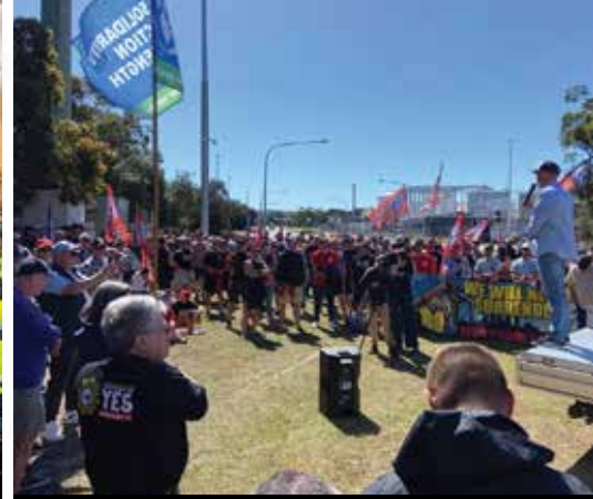
DP WORLD STRIKE SYDNEY