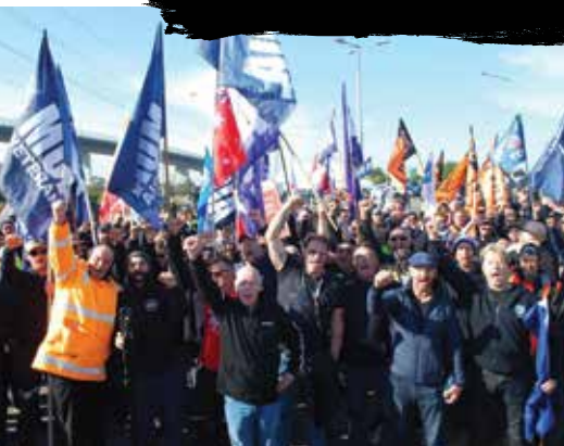
VICTORY ON THE DOCKS!