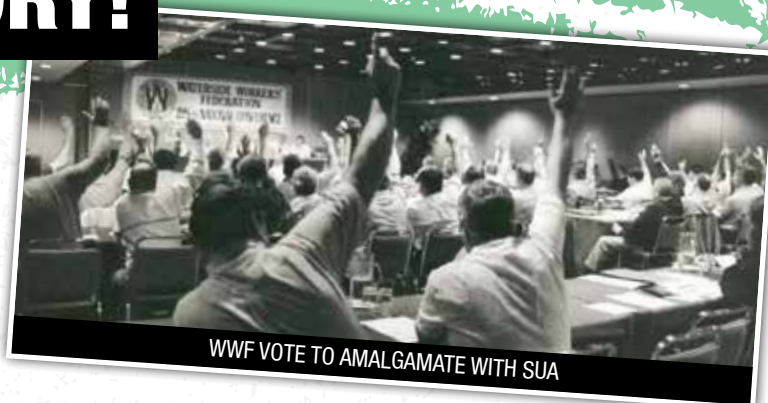
WWF VOTE TO AMALGAMATE WITH SUA

These stories will be brought to you as part of our CFMEU/MUA flyer each month, so that our next generation, like you and me, can read the real blue-collar history that is often lost over the years.