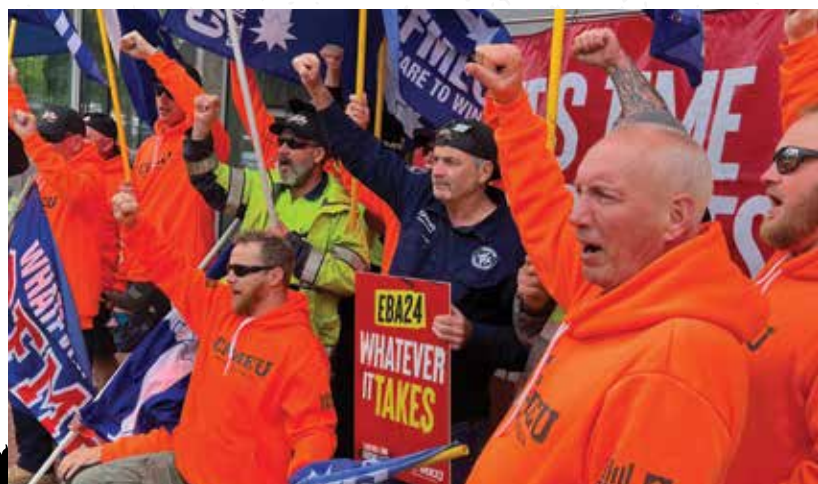
EBA24 WHATEVER IT TAKES!