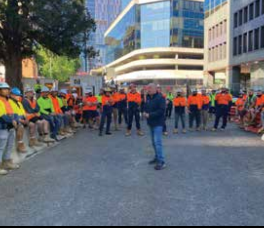
SITE MEETING SYDNEY