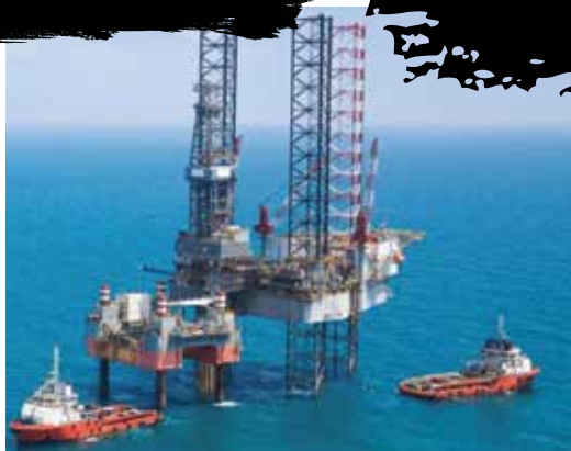
MUA MEMBERS SERVICING OIL RIGS