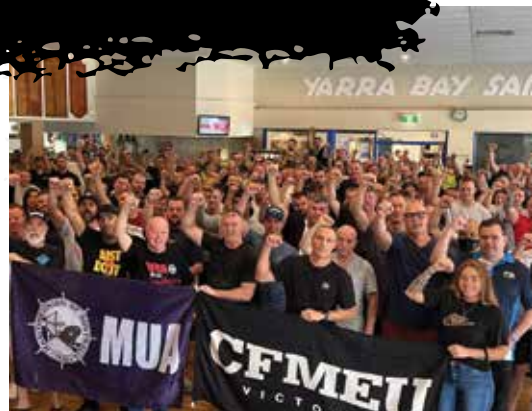
PATRICKS EBA MEETING SYDNEY